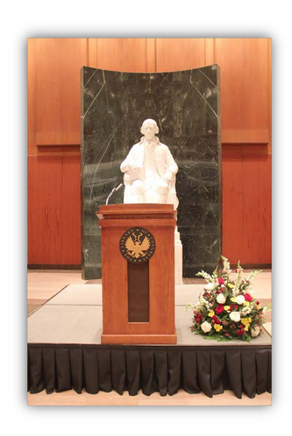
Library of Congress Special Event for the Journal of Consumer Affaris 50<sup>th</sup> Anniversary